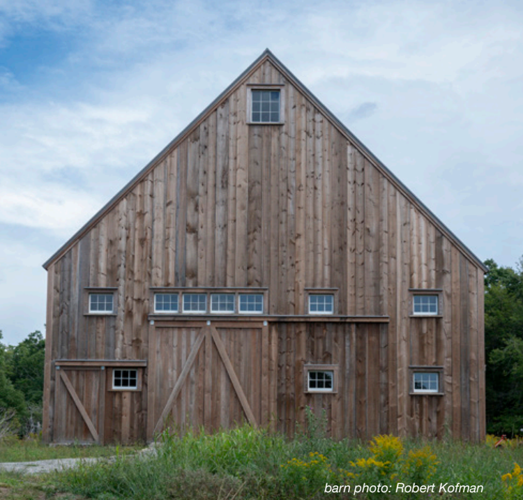
barn